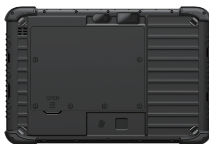
EM-I16H Rugged Tablet PC