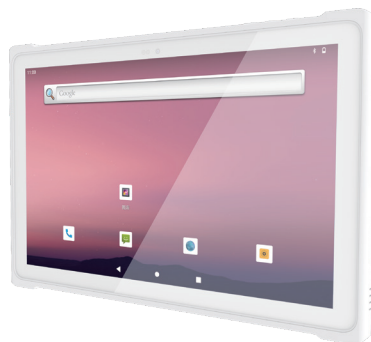
EM-T195 (Medical Tablet PC)