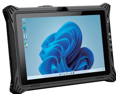
EM-I10J Rugged Tablet PC